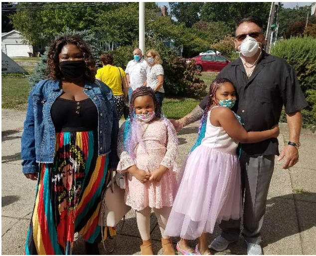
Woodridge

The Christian Education Team has decided that the safest way to involve children and youth at this time is through inter-generational worship and to not hold separate and in person Sunday school through the Fall. We are encouraging families to worship together in the sanctuary. At home and virtual educational opportunities are being developed to supplement Sunday worship.